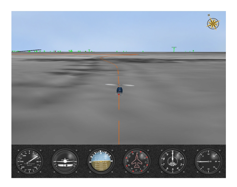
Figure 6. Flight evaluator software depicting satellite image lay over

The GAU 1000 flight recorder GPS mounted on the mini-UAV helicopter records altitude, air and ground speed, pitch, roll, yaw, latitude and longitude coordinates, flight times, and trip distances. Once the mini-UAV helicopter was operated over the land area used during flight testing, the recorded data was transferred to a lab computer loaded with Flight Evaluator software. The Flight Evaluator software allowed for satellite imagery lay over showing the terrain the unit flew over and can also be used for area calculations by using the longitude and latitude coordinates. The screen shot from the Flight Evaluator software is shown in Figure 6.