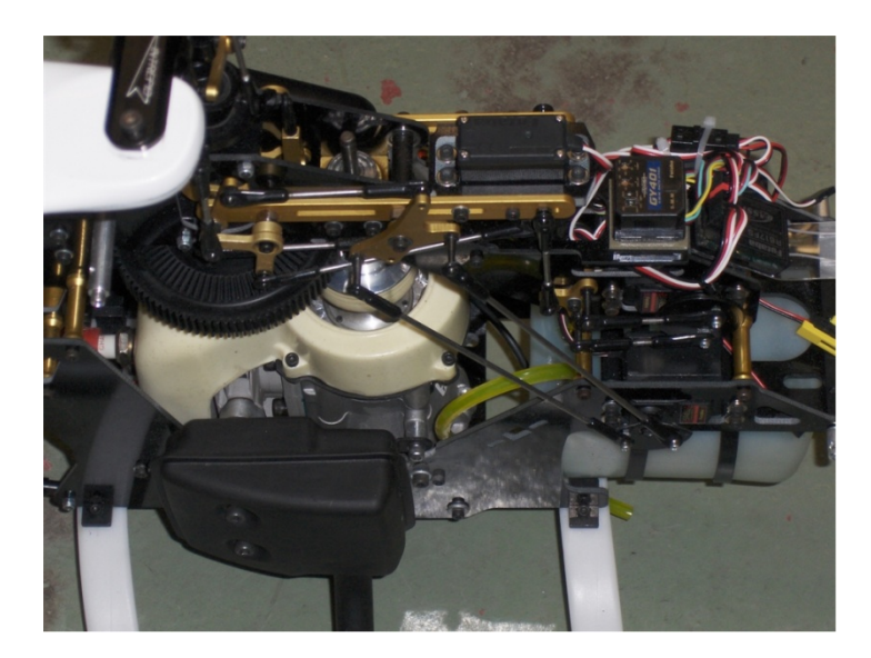
Figure 1. Power plant used on mini-UAV helicopter

It was decided early on that the mini-UAV platform must be very rugged – a machine that is solid, dependable and reliable. The mini-UAV platform was custom built using a 90-sized model designed for 810 mm main rotor blades (or longer) and powered by the Zenoah G260PUH gas engine with built-in air box and exhaust as shown in Figure 1. This engine was used because it runs smoothly, powerfully, reliably and importantly did not produce any noticeable radio frequency interference. It uses mechanical mixing, where each cyclic and the collective servos perform a single task with push/pull controls. A stacked side-frame structure and single stage gear reduction is used with the tail driven by a crown gear and pinion with a tube drive. The longer main blades were used to increase the payload lift capacity of the mini-UAV platform.