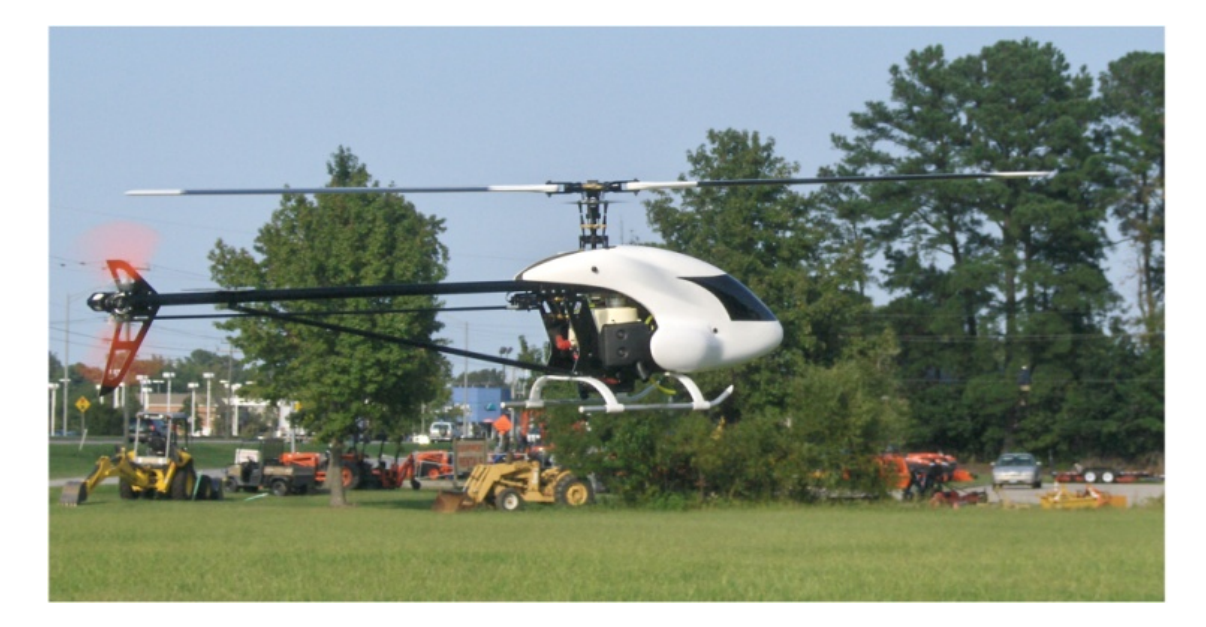
Figure 5. Mini-UAV helicopter during test flight around construction site

During test flights, the mini-UAV was able to hover about 30 minutes to complete fuel exhaustion. It was capable of lifting 15lbs dead load, and could instead carry 10 pounds payload, 5 pounds extra fuel in a heavily loaded condition, extending flight times to beyond 1 hour. Because the helicopter weighs 13lbs, when carrying 15 lbs extra, the fuel consumption could double because the power required would double. This is in a hover, if the UAV is in forward flight, the amount of power required decreases a great deal due to translational lift.