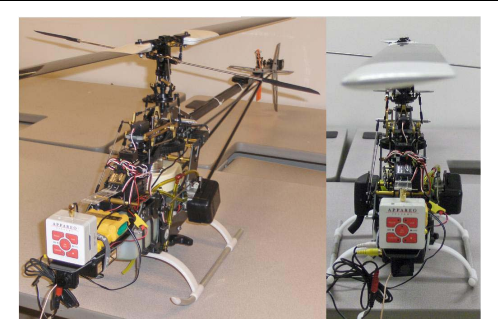
Figure 3. Mini-UAV helicopter platform