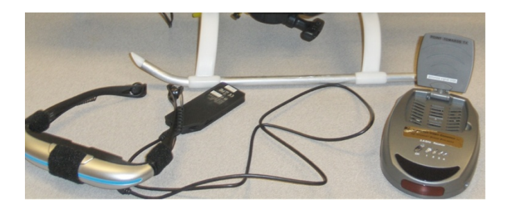
Figure 4. Ground station receiver and headset

The ground station is shown in Figure 4. The ground station consisted of a low power, light weight, 5.8 GHz frequency receiver with a range of up to 1 mile and a virtual reality headset. The headset enables first person view (FPV) for remotely piloted flight. By wearing virtual reality (VR) goggles, the surveyor or the remote 'pilot' can see what the camera mounted on the mini-UAV sees. This FPV flying experience not only facilitates observing the land terrain, but also helps in controlling the mini-UAV remotely during flight.